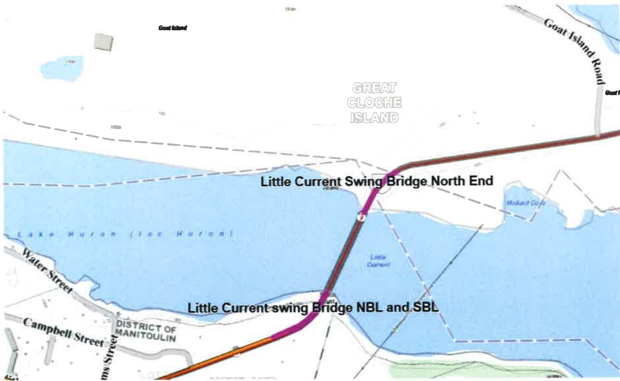
Map showing the location of the milling and paving on the North and South approaches of the Little Current Swing Bridge.